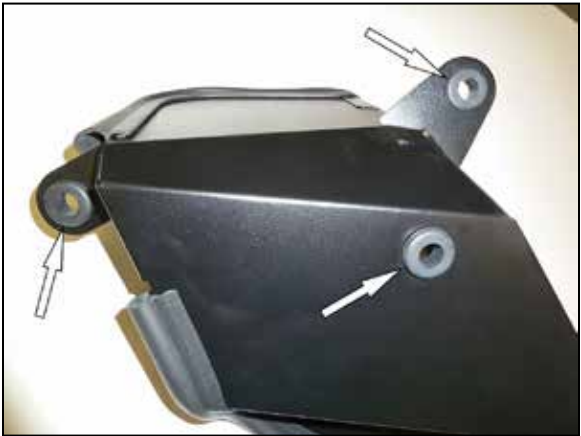
12. Install the mounting grommets into the heat shield as shown.