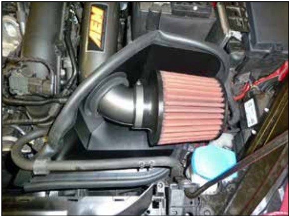
18. Install the AEM® air filter onto the intake tube and secure with the provided hose clamp.