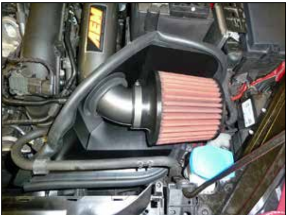
19. Reinstall the lower fresh air intake duct and then attach the coolant line to the factory retaining clips.