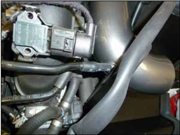
17. Connect the factory vent line to the fitting on the AEM® tube.