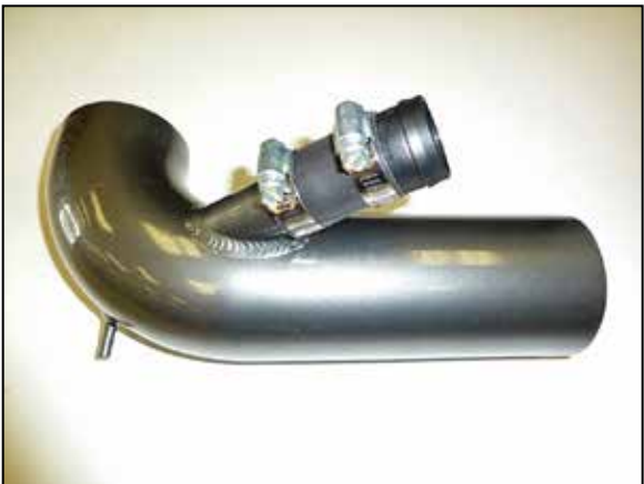
14. Install the provided BOV hose and quick connect fitting onto the AEM® tube as shown. NOTE: On models that are not equipped with this BOV connection, install the provided caplug onto the tube and secure with the provided hose clamp.