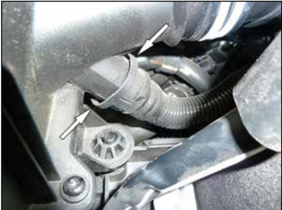
6. Squeeze the BOV quick release clamp and then disconnect the BOV hose from the factory air filter housing. NOTE: Some models may not be equipped with the BOV connection.