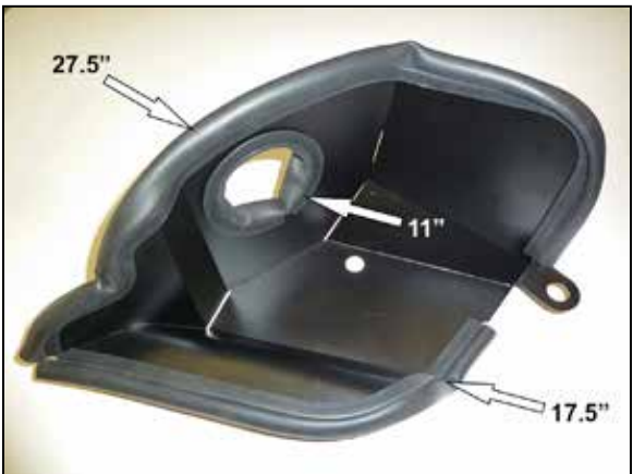
11. Install the edge trim onto the heat shield as shown.