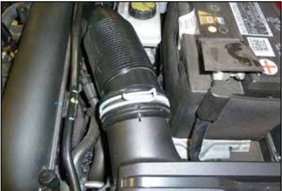
5. Release the clamp that secures the factory intake hose to the air filter housing and then disconnect the hose from the housing.