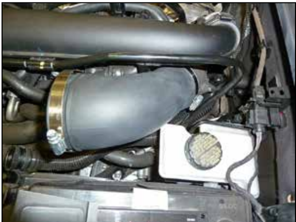
9. Install the provided angle coupler onto the turbo inlet and secure with the provided hose clamp.