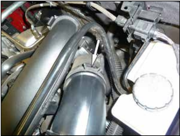
8. Release the spring clamp that secures the factory intake tube to the turbo inlet and then remove the tube from the vehicle.