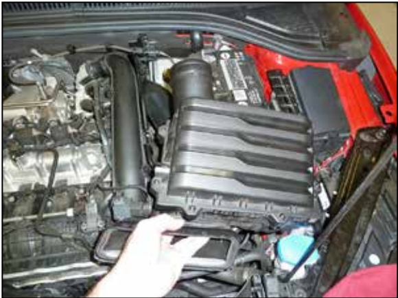
7. Pull the factory air filter housing up and remove it from the vehicle. NOTE: AEM recommends that customers do not discard factory air intake.