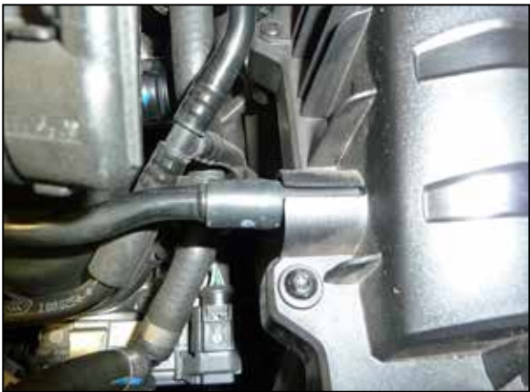
4. Disconnect the vent line from the air filter housing.