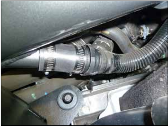
16. On vehicles equipped with the BOV connection, Install Connect the factory BOV hose to the quick disconnect fitting attached to the AEM® intake tube.