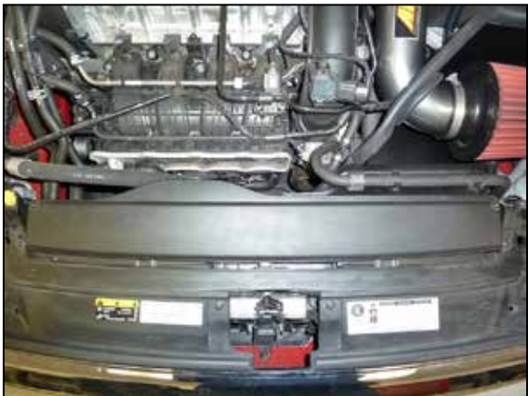
20. Install the upper fresh air duct onto the lower duct and secure with the factory hardware.