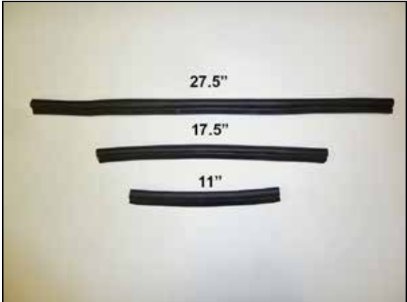
10. Cut the provided edge trim into three sections as shown.