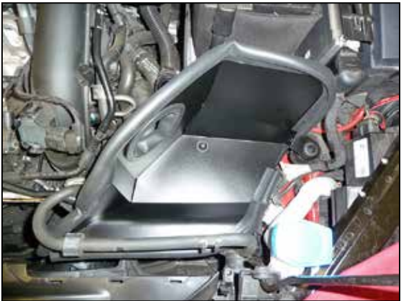
13. Install the heat shield onto the factory mounting studs as shown.