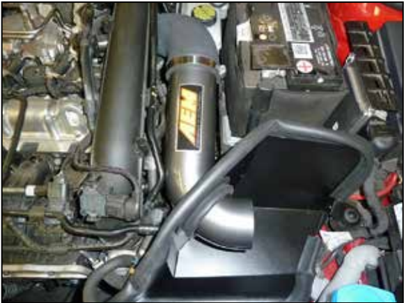
15. Install the AEM® tube into the coupler and heat shield as shown, Align the tube for best fit and secure with the provided hose clamps.